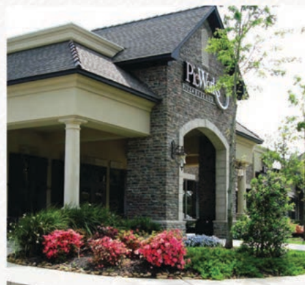
The Shoppes On Tower II