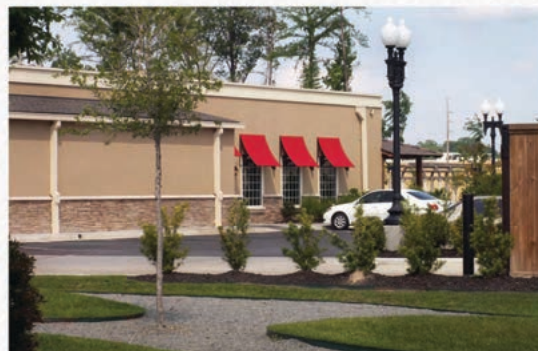
The Shoppes On Tower